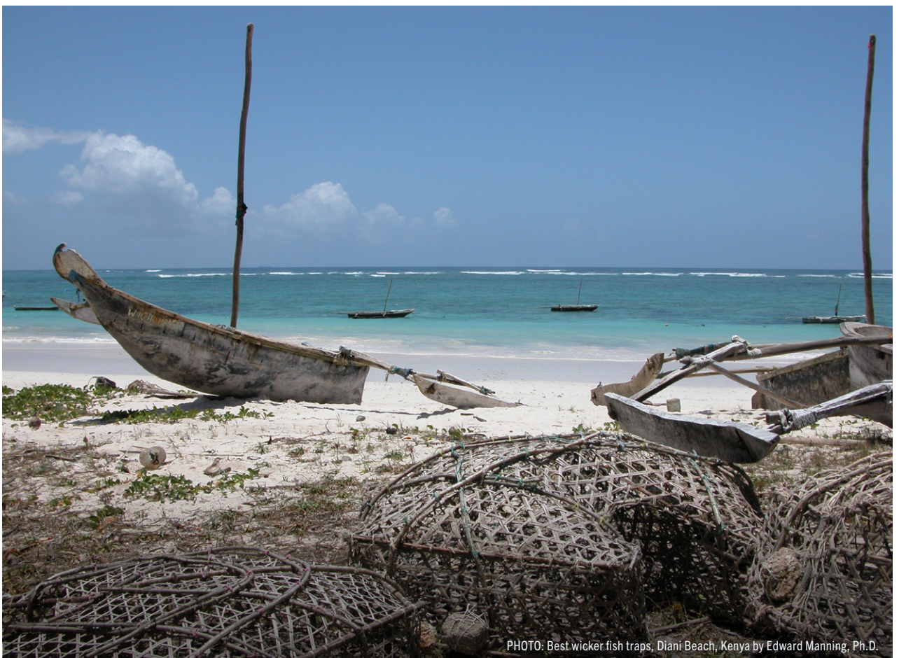
PHOTO: Best wicker fish traps, Diani Beach, Kenya

ENFORCEMENT: Present Treaties, Regulations, and other legal instruments to halt overharvesting of national and International oceanic waters can add substantially to greater fisheries resilience and food sources if properly enforced globally. This includes the global commons beyond national boundaries. Most especially in key areas of fish biodiversity and abundance.