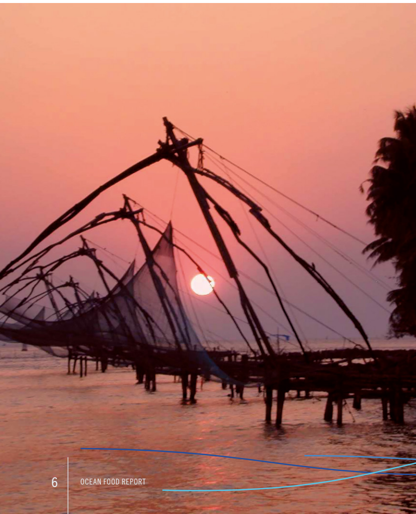
Fishing nets, Kochi, India

These above efforts combined can increase estuarine and coastal food production by 25-40%. A balance between consumption, production, waste food, and preservation of habitats is also needed. Each citizen can adjust their consumption and their waste of food. Additionally humans need to explore possible food products to add marine products to their diets as Asians have added seaweeds to their various soups, and added a variety of marine invertebrates to their nutritious foods making them more delicious.